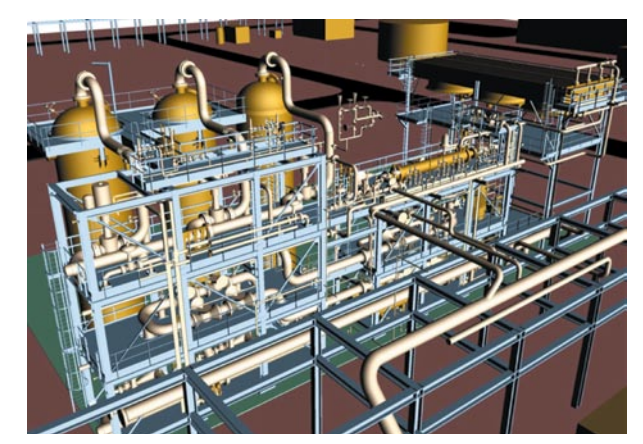
Figure 3. 385 MMSCFD silica gel plant supplied by Costain to the Rashid Petroleum Co., Idku, Egypt.

outside the hydrocarbon dew point specification.